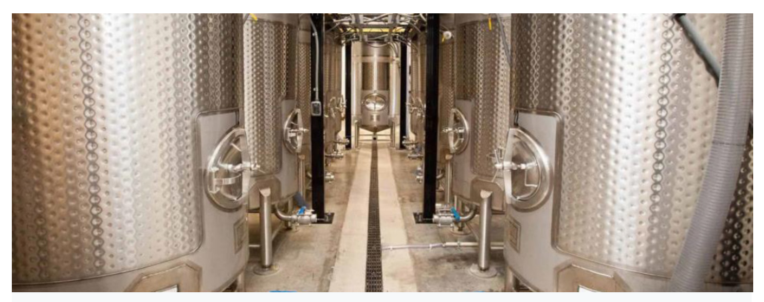
Drums and Liquid Mash Process, Smooth Ambler Spirits, Maxwelton, West Virginia

The IAC team (<a href="https://industrialassessmentcenter.wvu.edu/">https://industrialassessmentcenter.wvu.edu/</a>) made several recommendations and identified specific energy savings opportunities for the facility's manufacturing and operational processes.