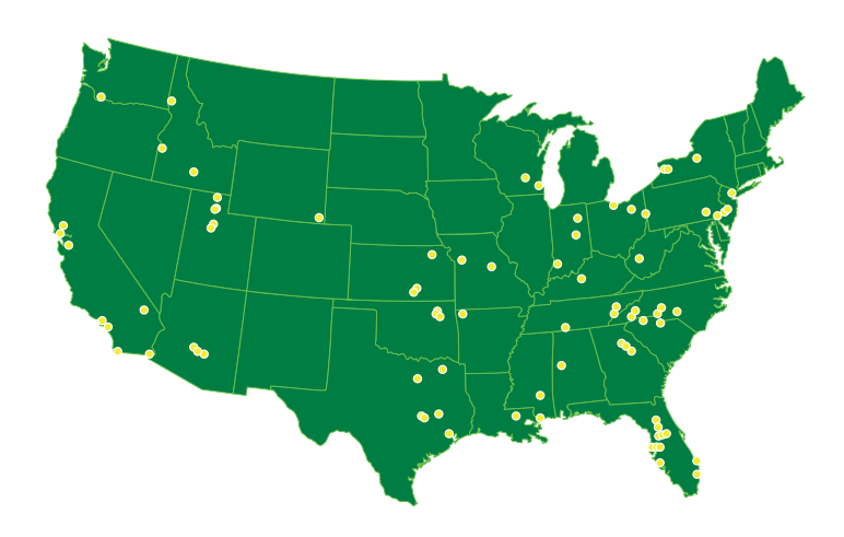
Figure 2. IAC Assessments Nationwide, January - March 2021

Plants assessed were located in 29 states (Figure 2). The assessed plants represent a broad range of industries, fabricated metals, transportation equipment, and food manufacturing being the most common. (Table 3).